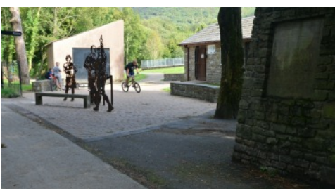
The paved area in front of the Centre, repaired after the storm damage of February 2014.

During November 2013 we displayed a National Waterfront Museum exhibition entitled Strikes and Riots. One of the themes of this exhibition was the Rebecca Riots.