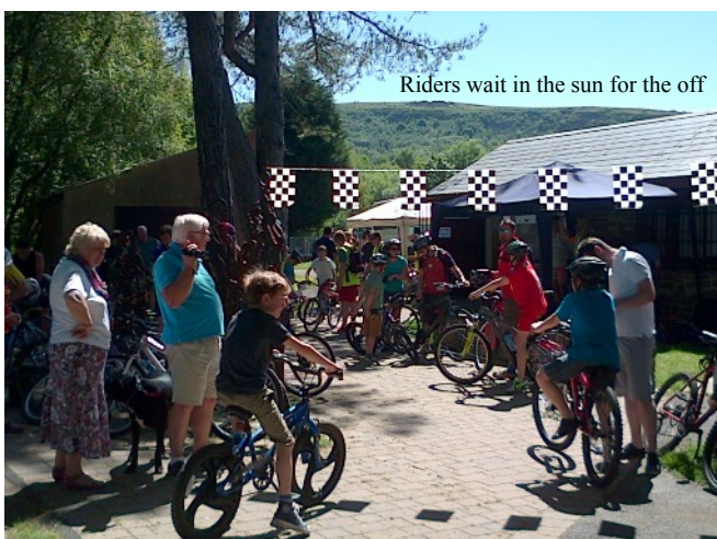
Riders wait in the sun for the off