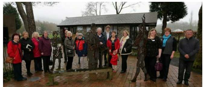
Delegates with our local heroes