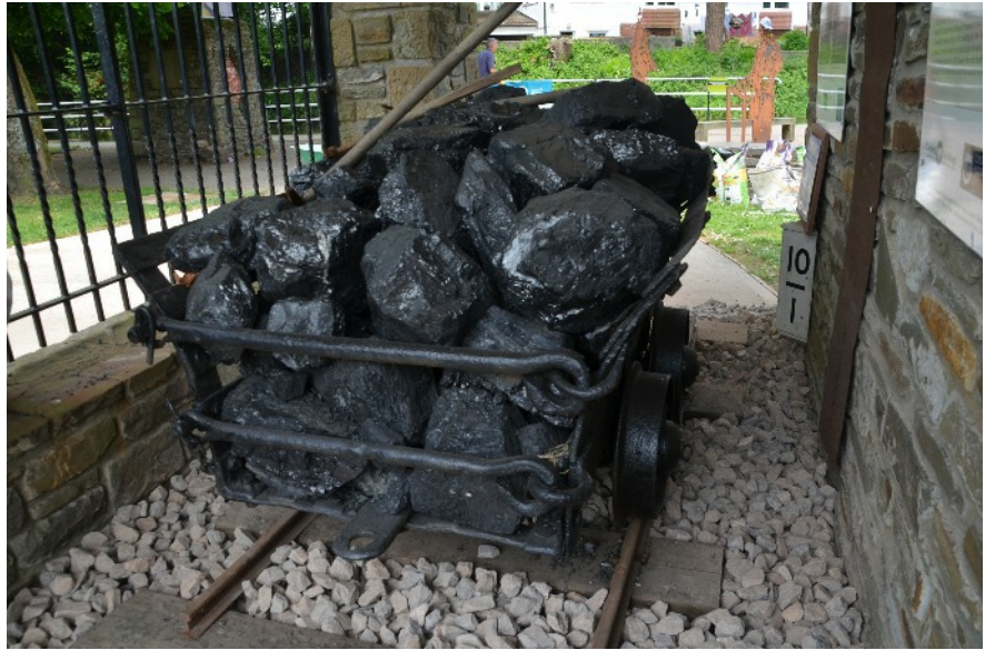
The dram with its coal and picks.

These large lumps of anthracite really show off as they sparkle in the sun. On top of the coal there is a display of three colliers' picks, from different eras of the coal mining industry. An information board complements the display and gives details of the picks and the coal. The various volunteers and helpers contributed immensely to the project, in particular James King Engineering who donated the rails and did the machining and fabrication work. Thanks are also due to Steve Mogford of Resolven who extracted the wheels from the Melincourt Brook and transported them to Coedgwilym, all for nothing.