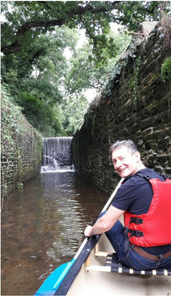
Into Trebanos Lock chamber

In September the British Science Festival came to Swansea for the first time in over twenty years. As well as the formal lectures at the University there were to be outreach events to bring science to the community. We teamed up with Swansea Canal Society and offered a joint event titled 'The Power of Water'. The aim was to show how powerful a force water can exert and how this can be used to move boats up and down hills.