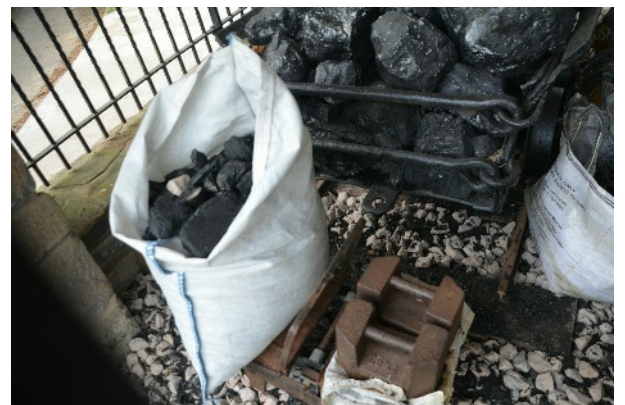
Coalman's scales and weights

To complete the display Mike Diment donated a set of coalman's scales and weights, a reminder of the days when fuel didn't come to your house in a pipe.