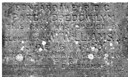
Commemorative Plaque at entrance to Coedgwilym Park