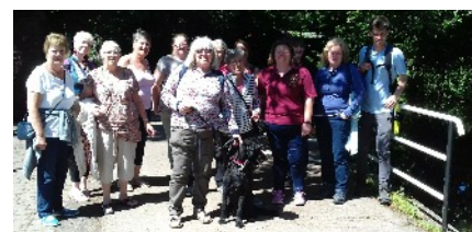
Well being walkers in Coedgwilym in June

A Clydach Network was set up in January 2018 which has brought community groups together once a month to talk about what they do and how we can work together. Two group activities have been set up in Clydach, the monthly Conversation Club and a monthly Wellbeing Walk. Clydach Heritage Centre (through Jean)