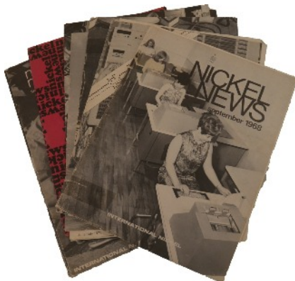
A selection of Nickel News