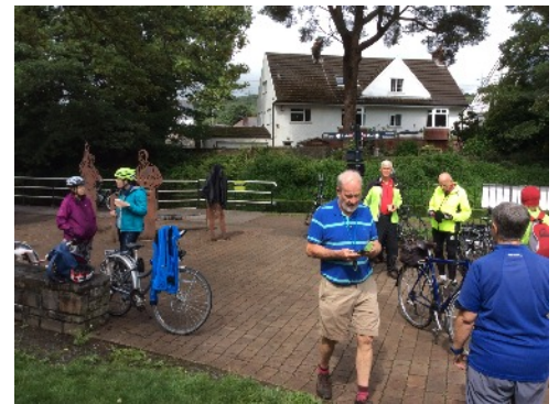
Riders on the Gower Cycling Festival's Port to Pottery ride.

The Centre has hosted various events again this year. The annual 43-2-C cycle ride organised by Cwmtawe Cycle Group to promote the cycle route between Clydach and Swansea Bay. The Gower Cycling Festival's Port to Pottery ride also called in, as it has done for the past four years, en route to Pontardawe. More locally the Cwmtawe Medical Practice's Social Prescribing Group have taken to meeting at the Centre and has been taking people on Well-being walks along the canal, popping in for a chat and a warm drink. At the end of August Swansea Council organised a Sport in the Park day, this brought many people to Coedgwilym and quite a few visited the Centre to sample the rolls and cakes and also to look at and comment on the displays.