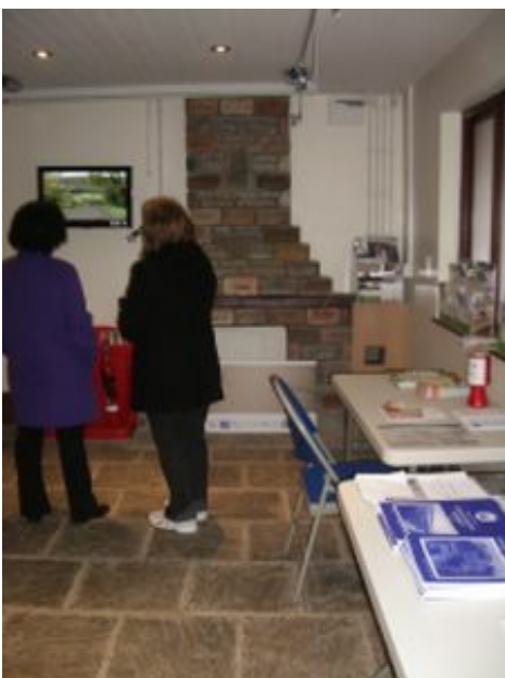
Talking to a visitor about one of the Centre's DVDs

I didn't know these little gems of local information until I started helping at the Centre. I spend three hours on either a Saturday or Sunday afternoon about once every four or five weeks. Each time I pick up another little snippet or I meet some interesting people! There's the lady who comes in with her dog – a beautiful German Shepherd. She is writing an illustrated history of Craig Cefn Parc and she brings it in to show us how she is progressing. It is a work of art, informative and lovingly