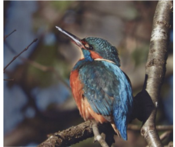
Kingfisher