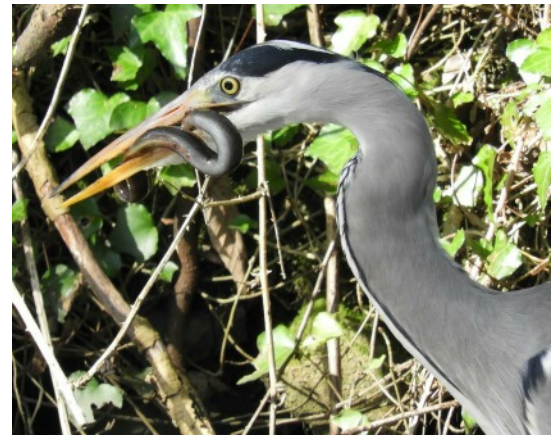
Heron with eel, near Trebanos Lock