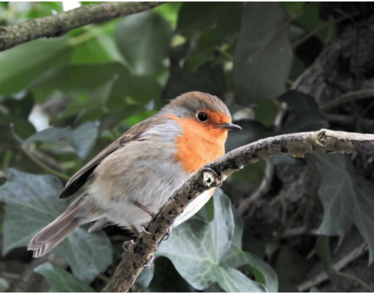
Robin

The Swansea Canal is a fantastic resource alongside the Centre and a walk along it can be brightened if we see any of our little friends. They may not be The Wind in The Willows' Ratty, Toad and Mole but apparently an otter has been seen between the river and the canal.