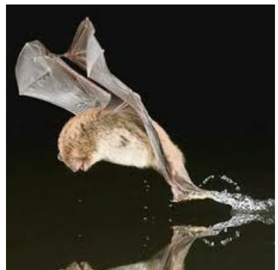
Daubenton's bat feeding on the water