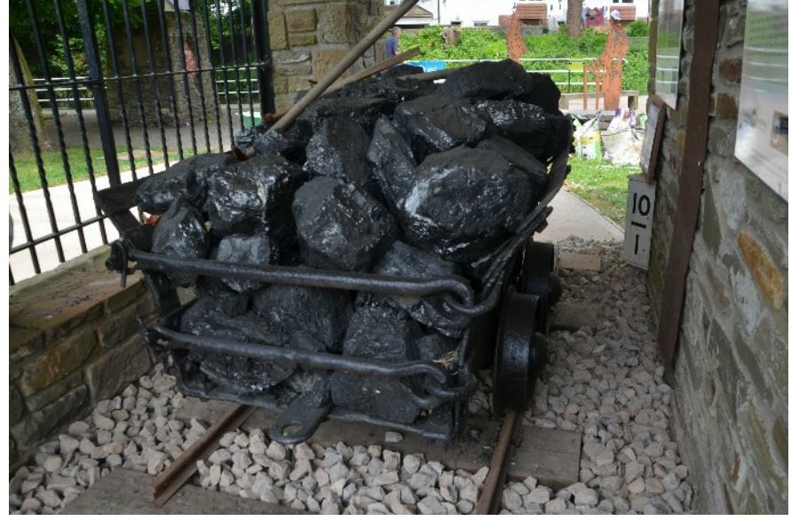
The dram with its coal and picks.

These large lumps of anthracite really show off as they sparkle in the sun. On top of the coal there is a display of three colliers' picks, from different eras of the coal mining industry. An information board complements the display and gives details of the picks and the coal. The various volunteers and helpers contributed immensely to the project, in particular James King Engineering who donated the rails and did the machining and fabrication work. Thanks are also due to Steve Mogford of Resolven who extracted the wheels from the Melincourt Brook and transported them to Coedgwilym, all for nothing.