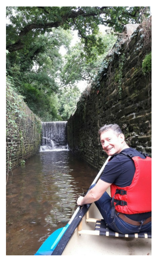
Into Trebanos Lock chamber

In September the British Science Festival came to Swansea for the first time in over twenty years. As well as the formal lectures at the University there were to be outreach events to bring science to the community. We teamed up with Swansea Canal Society and offered a joint event titled 'The Power of Water'. The aim was to show how powerful a force water can exert and how this can be used to move boats up and down hills.