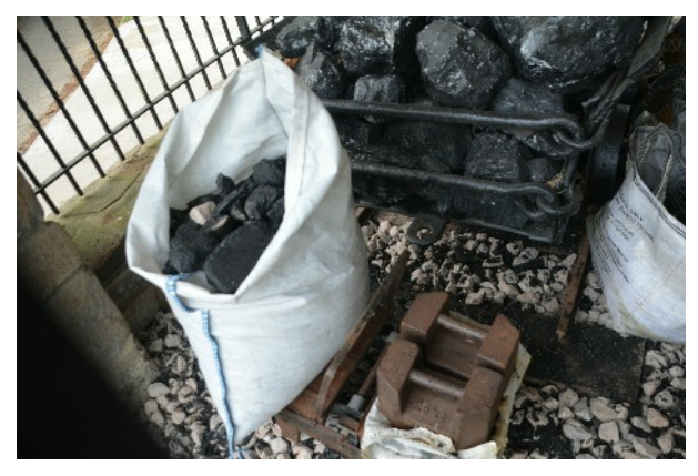
Coalman's scales and weights

To complete the display Mike Diment donated a set of coalman's scales and weights, a reminder of the days when fuel didn't come to your house in a pipe.