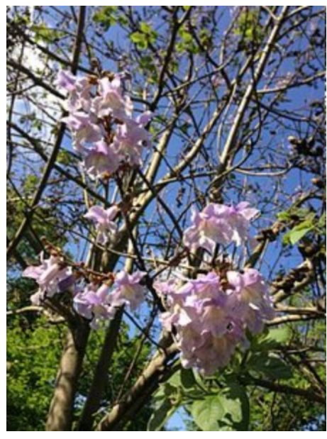
Paulownia Tomentosa flowers as we hope to see them in years to come.

This new Tree is not the only unusual tree in the Park. Do you recognise the tree in the picture below left? Answer below.