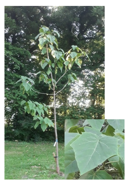
Paulownia Tomentosa in the park today